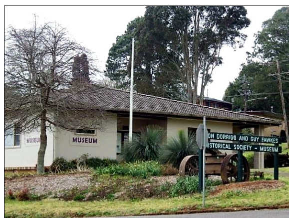
Don Dorrigo and Guy Fawkes Museum

Our second social event for 2018 is a bus trip to the Don Dorrigo and Guy Fawkes Museum at Dorrigo on Thursday 22 February 2018. Our bus trips are always very enjoyable, with plenty of laughs and an opportunity to get to know your fellow members. The bus will depart the Glasshouse at 8.30am with a morning tea stop at Nambucca Heads. After visiting the Dorrigo Museum we will lunch at the Dorrigo Heritage Hotel and return with a stop at Bellingen for browsing and shopping. Cost is $50 per person which includes coach travel and museum entry. Morning tea and lunch at members' own expense. Bookings and payment by Monday 12 February 2018 please.