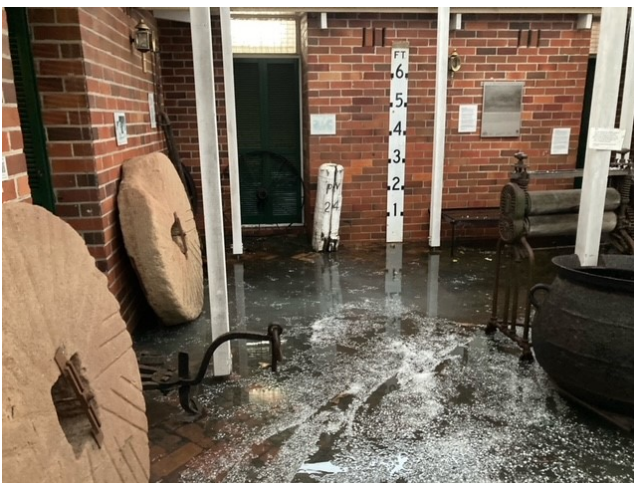
History Awash or Awash with History? The North Courtyard immediately after a recent hailstorm.